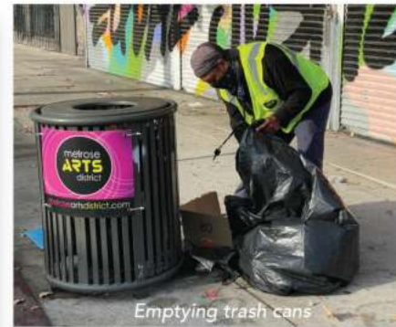
Emptying trash cans