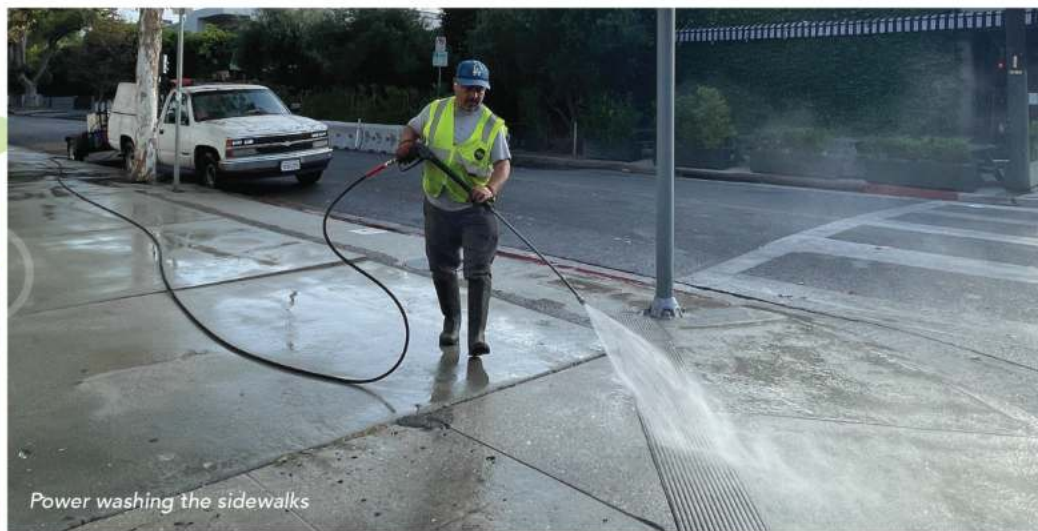
Power washing the sidewalks