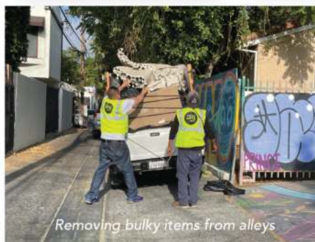
Removing bulky items from alleys