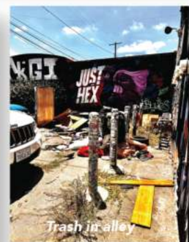
Trash in alley