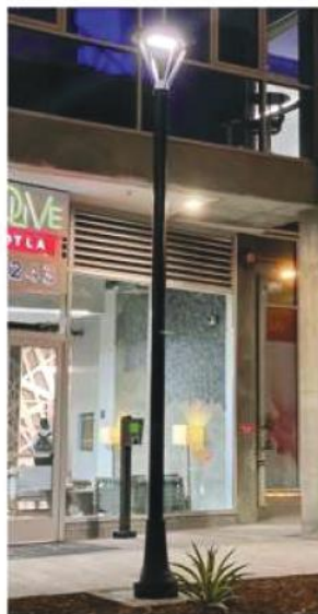
New light poles, day and night views